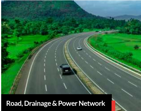
Road, Drainage & Power Network