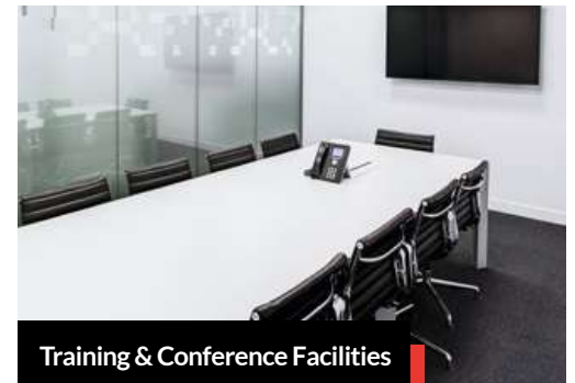
Training & Conference Facilities