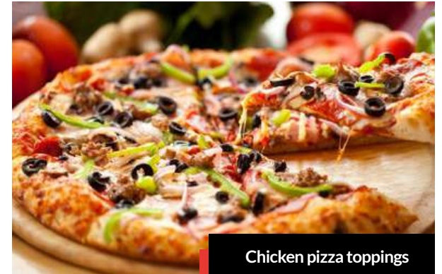
Chicken pizza toppings