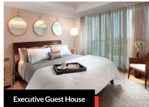
Executive Guest House