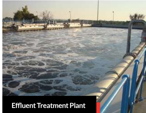
Effluent Treatment Plant