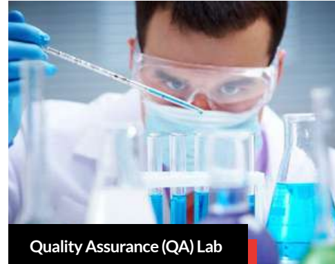
Quality Assurance (QA) Lab