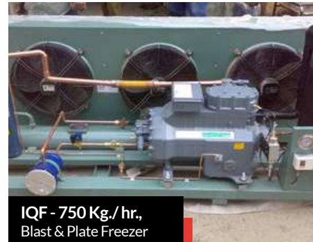
IQF - 750 Kg./hr., Blast & Plate Freezer