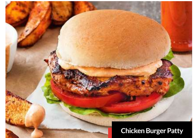
Chicken Burger Patty

Value added products are on great demand. We have a whole range of 100+ products available with us.