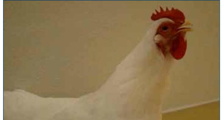
Figure 1. Chicken with neck extended, demonstrating respiratory distress.

Signs of disease in subacute outbreaks may resemble those of an acute event, but with a slower progression of disease, and mortality on the lower end of the spectrum (10–30%). Post-mortem findings are generally less marked in these instances.