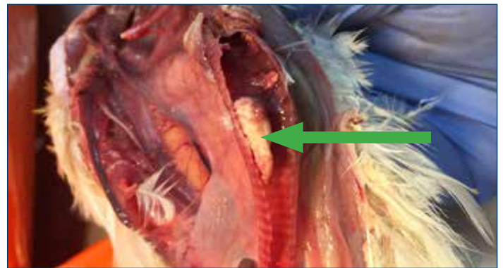
Figure 3. Fibrinohemorrhagic tracheitis characteristic of ILT. This plug may occlude the trachea and cause death from asphyxiation.

Clinical signs and necropsy lesions can be suggestive of ILT but cannot be differentiated from other diseases with similar presentation. The main differential diagnoses are Newcastle disease, infectious bronchitis, avian influenza, and wet pox. In particular, the clinical and post-mortem signs of ILT and wet pox may appear identical.