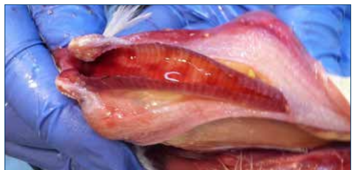
Figure 4. Hemorrhage within the trachea is a common sign of infection.